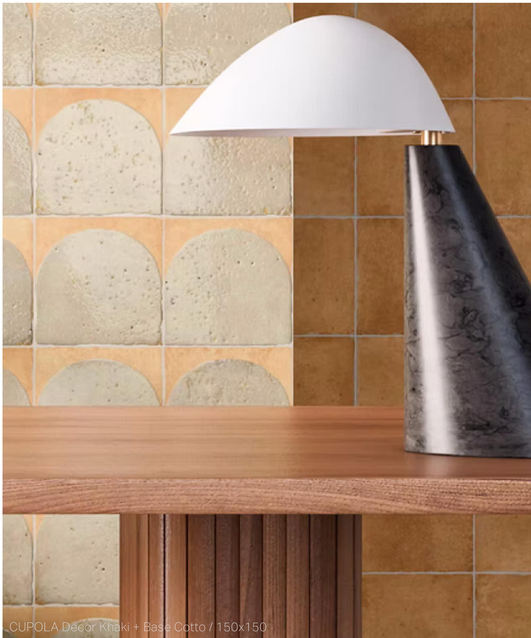
CUPOLA Decor Khaki + Base Cotto / 150x150