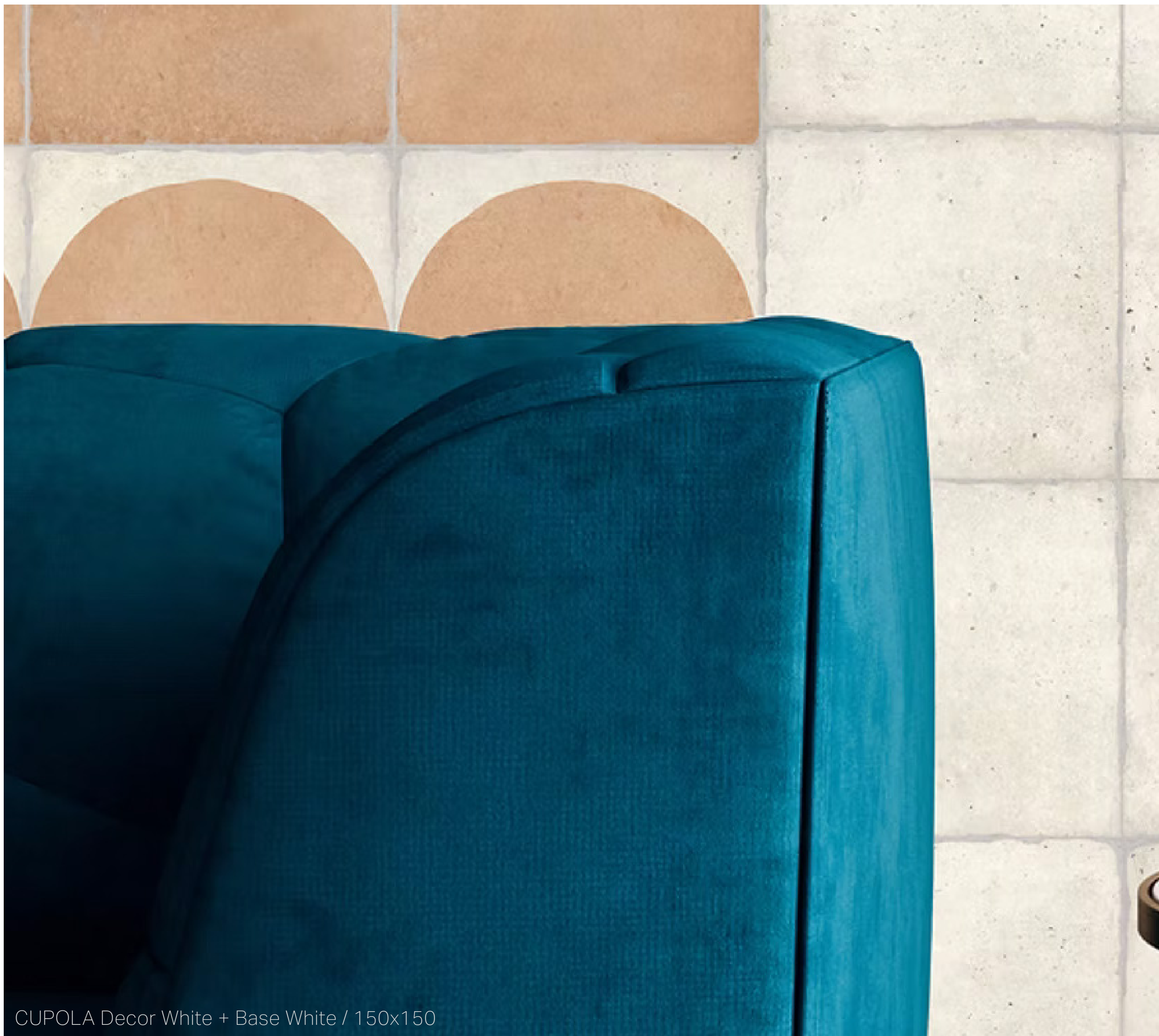
CUPOLA Decor White + Base White / 150x150